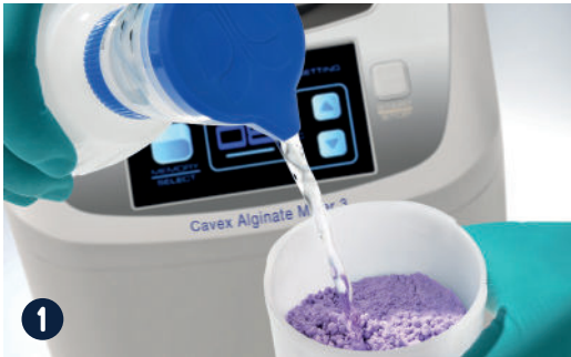
1 Put the right dosage of alginate and water in the mixing cup.