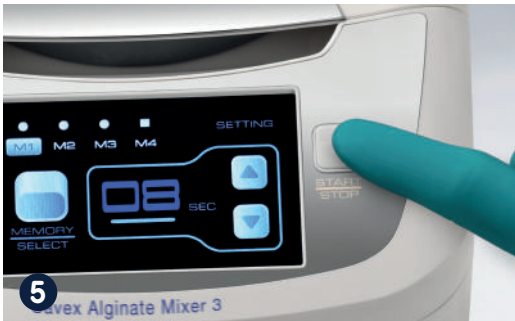
5 Select program, press start and wait for the program to finish.