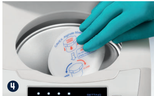
4 Place the mixing cup in the mixer and close the lid.