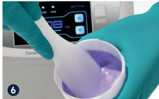
6 Remove the alginate mix from the mixing cup in a single movement and apply it to the tray.