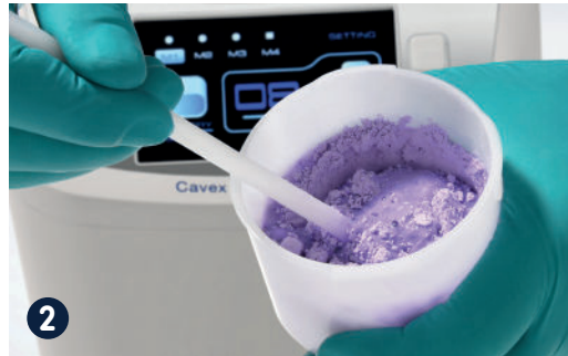
2 Stir shortly to make cleaning the mixing cup easier and preserve the mixer.